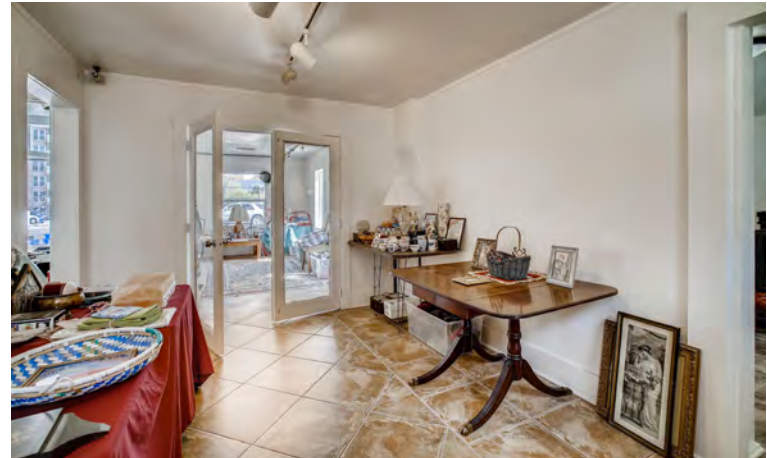
Back Side Room