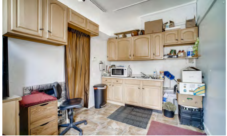
Break Room w/Kitchenette