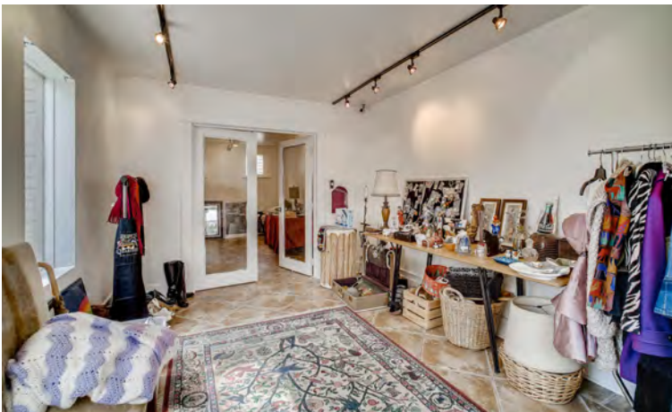
Front Side Room