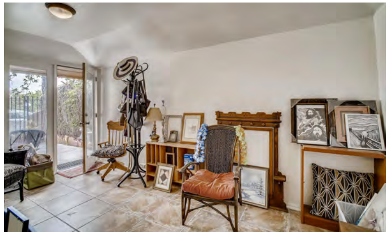
Side Room to Courtyard